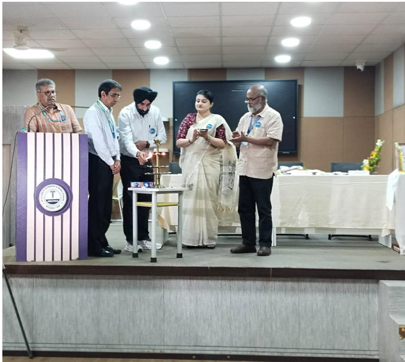
Ceremonial lamp lighting marking the inauguration of the World Veterinary Day 2026 celebrations by distinguished dignitaries.