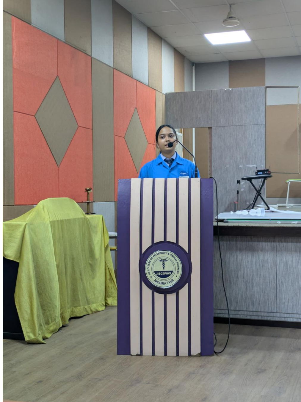
Extempore speech by 1 st year students, JISCOVAS.