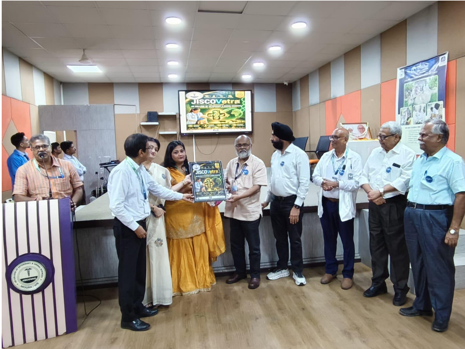
Unveiling of Annual JISCOVAS magazine “ JISCOVETRA”