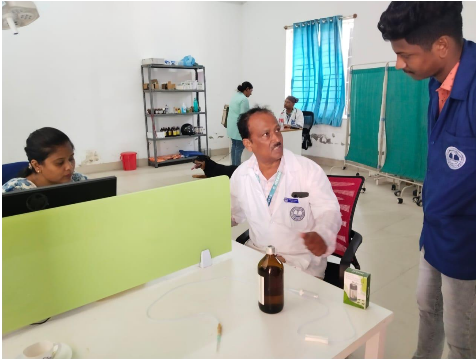
JISCOVAS faculties organizes Free health camp on occasion of world veterinary day .