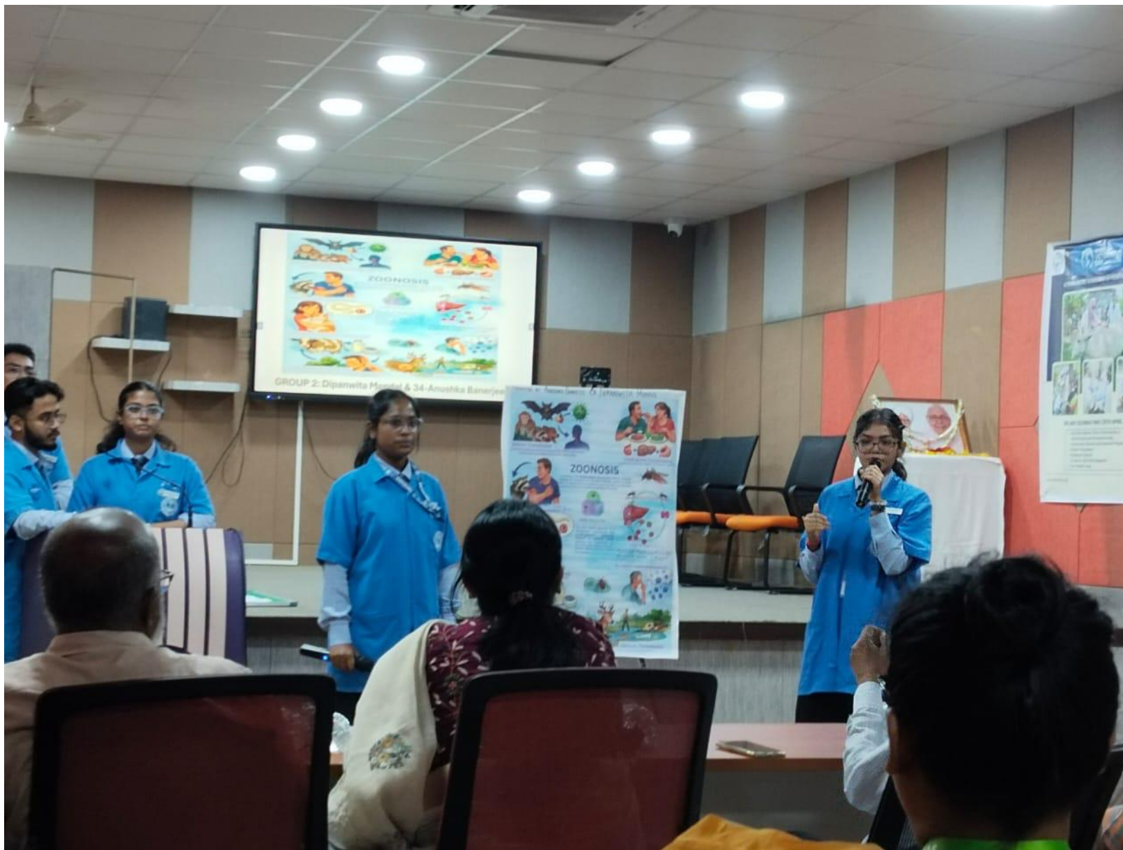
Poster presentation by 1 st year students, JISCOVAS.