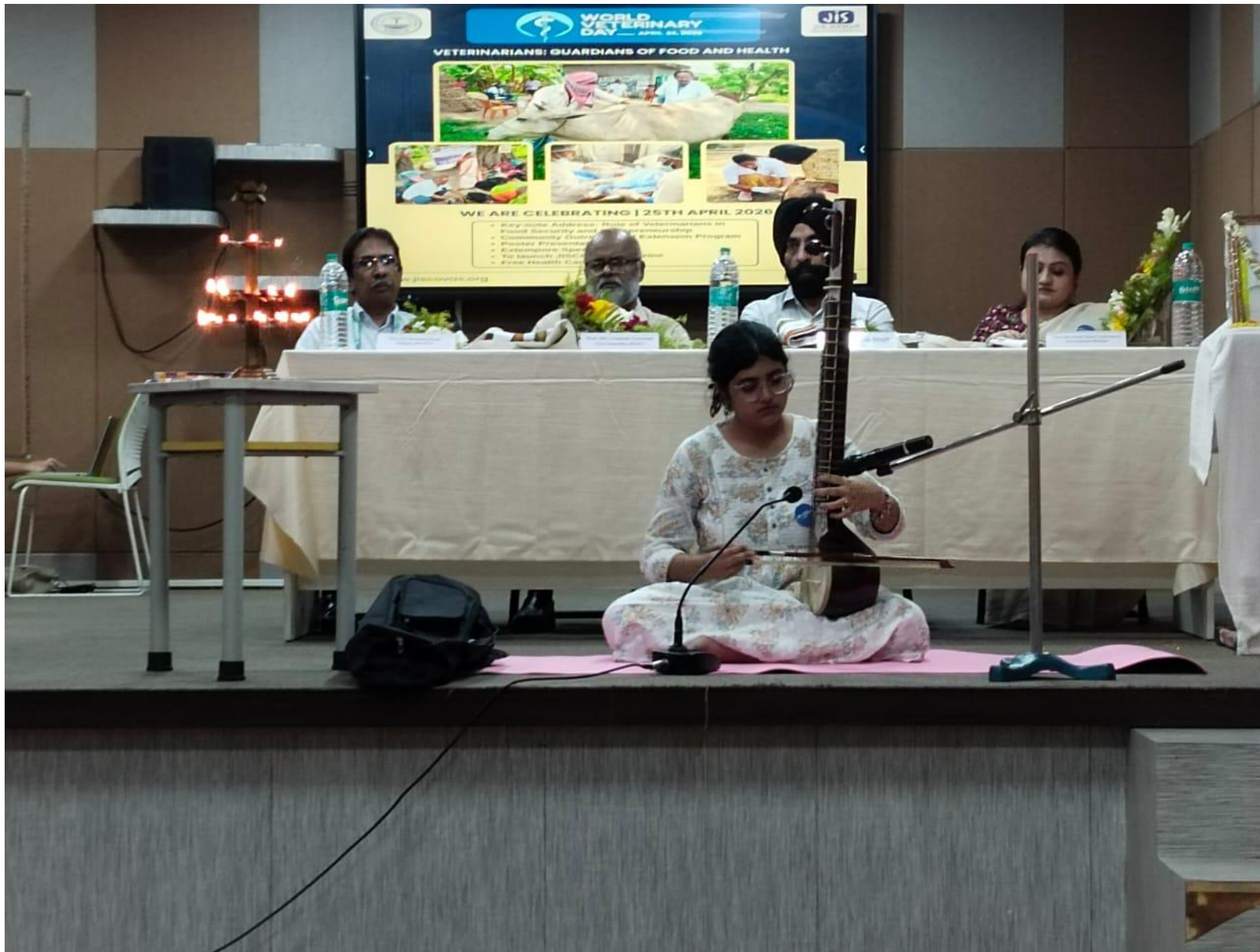
The inauguration ceremony featured a soulful Esraj recital by a student of JISCOVAS 1st Year.