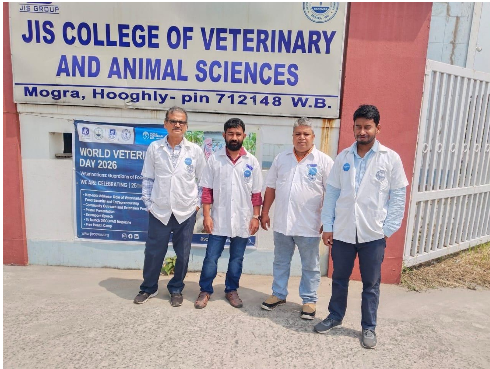
Clinical team JISCOVAS on World Veterinary Day