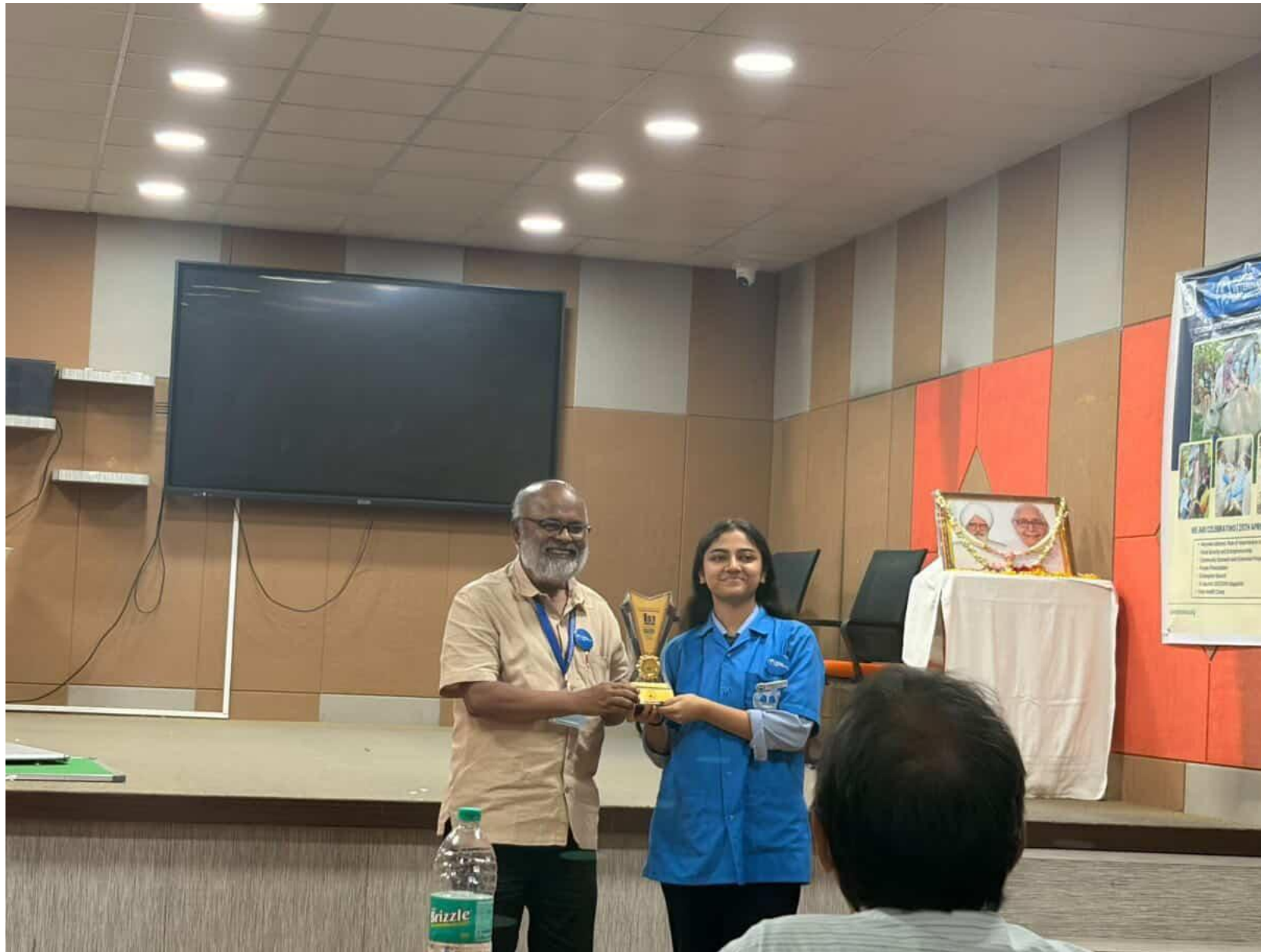
Prize distribution by honorable chief guest .