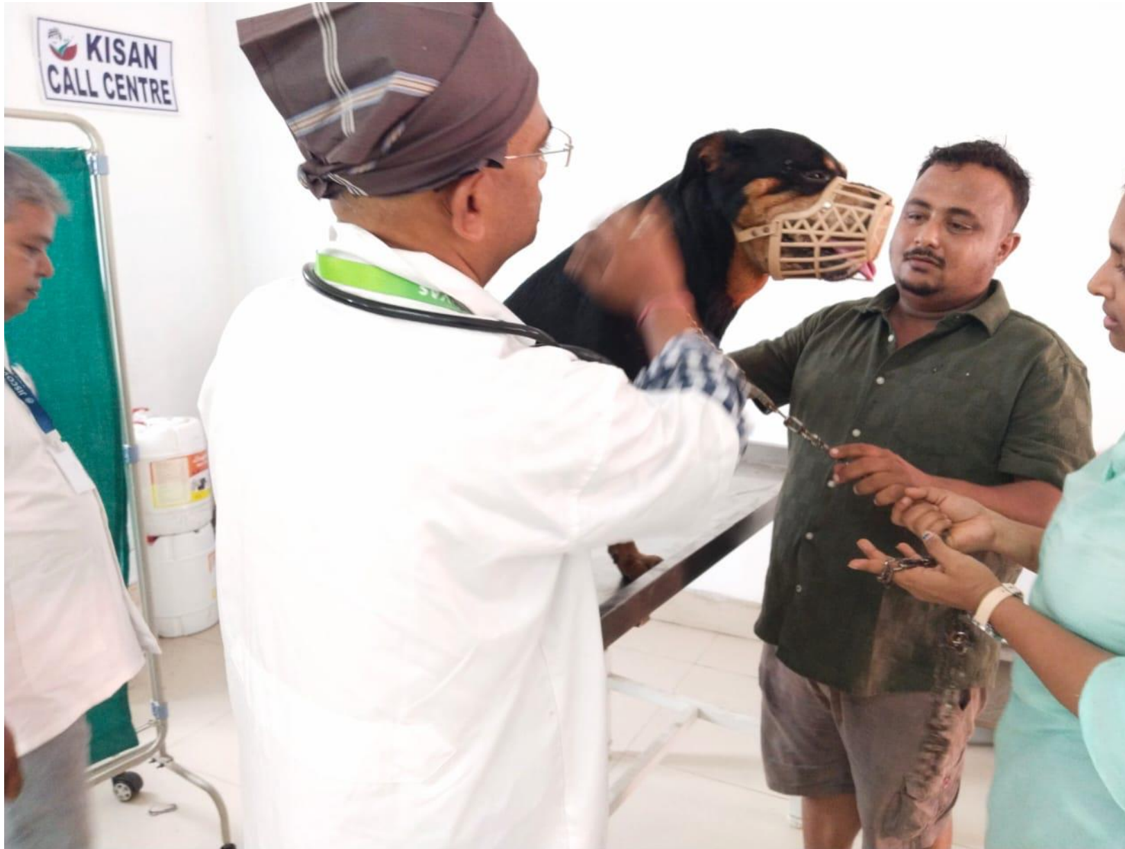
JISCOVAS faculties organizes Free health camp on occasion of world veterinary day .