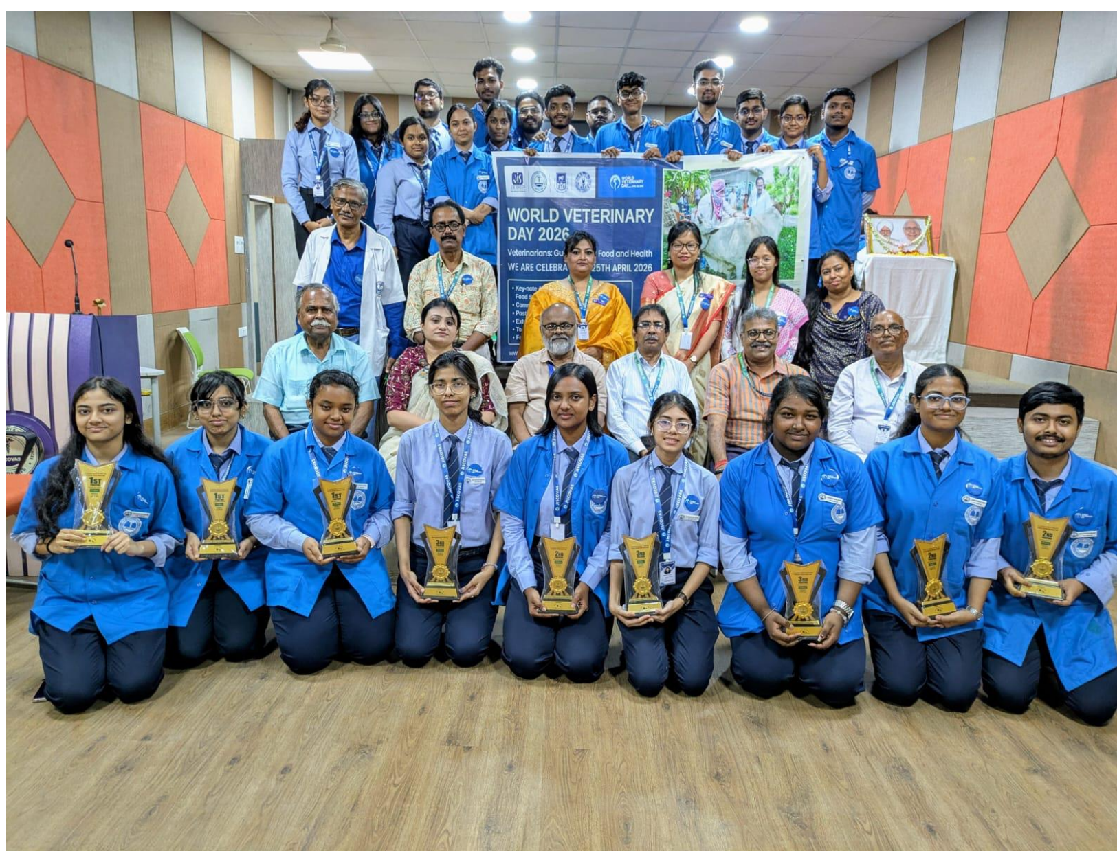
JISCOVAS celebrating WORLD VETERINARY DAY, 2026.