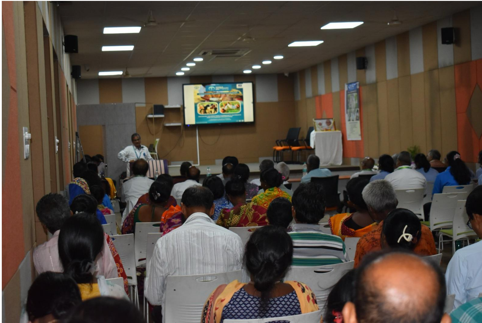
Faculty ,JISCOVAS conducting interactive session on poultry farming.